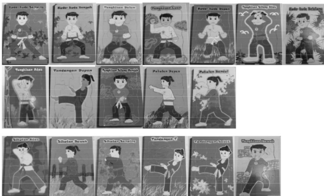
Picture. Puzzle display and coloring book After Final Revision